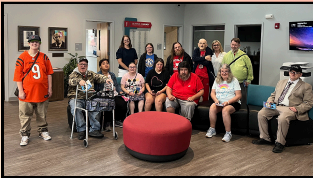
Aktion Club members pause for a photo in the lobby of the Lincoln Community Center, where they met in May to learn about the organization.